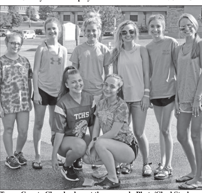
Towns County Cheerleaders at the car wash.